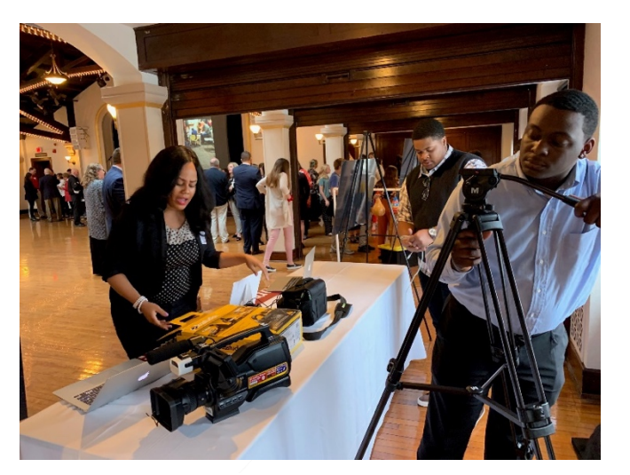
Students of Sumner Streaming interact with their advisor as they prepare to present at an Innovative Technology Education Event (ITEF) event.